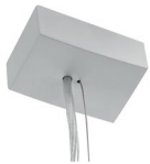
Electrical suspension Pieces in set: 1