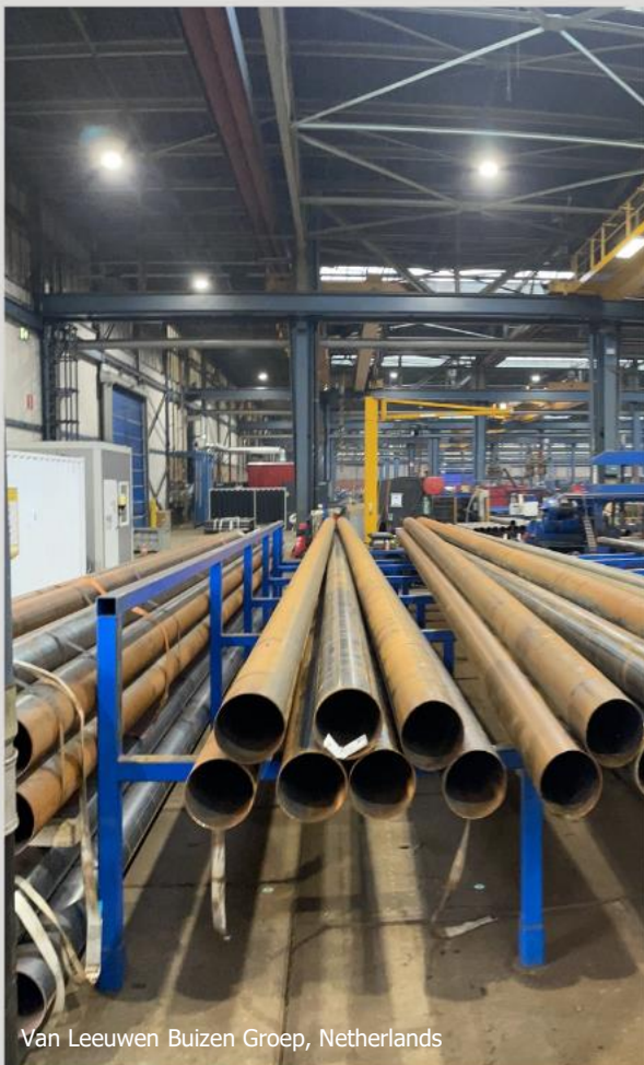
Van Leeuwen Buizen Groep, Netherlands

This includes factory halls, warehouses, workshops, and the like. From very tall buildings, like halls for ship building that require formidable high bay fixtures to work shops with lower ceilings for which light tracks are more suitable.