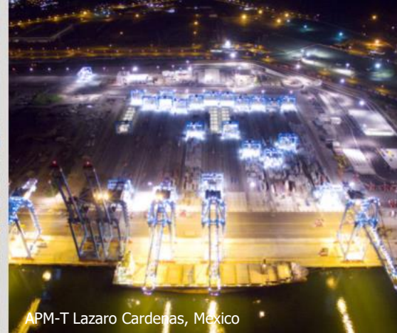
APM-T Lazaro Cardenas, Mexico