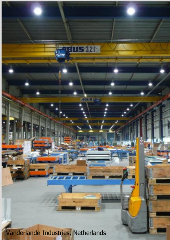
Vanderlande Industries, Netherlands

A sustainable world by being a market leader in industrial lighting solutions. And we do this by realizing tailor-made, reliable and sustainable lighting solutions for our customers. We focus on their specific needs, wants and desires, whilst always keeping our promises and we are uncompromising when it comes to quality.