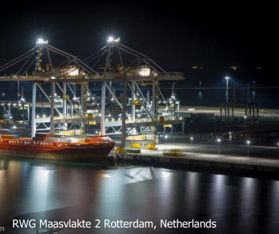
RWG Maasvlakte 2 Rotterdam, Netherlands