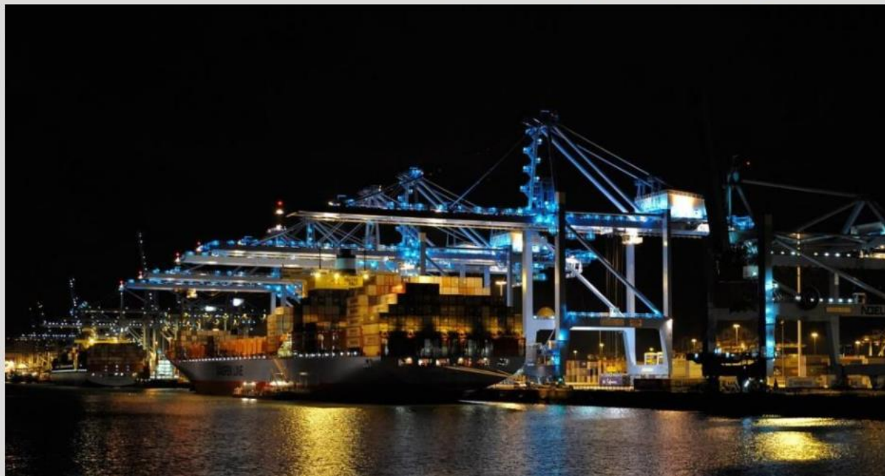
AMP-T Maasvlakte 2 Rotterdam, Netherlands