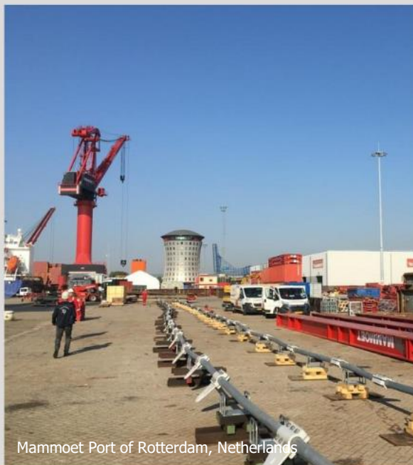
Mammoet Port of Rotterdam, Netherlands

As of the start of Yourlight, we have accumulated much experience and expertise in yards and terminal lighting in ports all over the world. We supply fixtures from renowned manufacturers that are suitable for application in harsh environments with salty air, windy conditions, horizontal rain, dust and sand, as well as high ambient temperatures. From the North sea shore to the desert of Dubai. But we also have competitive solutions for a small yards or parking lots.