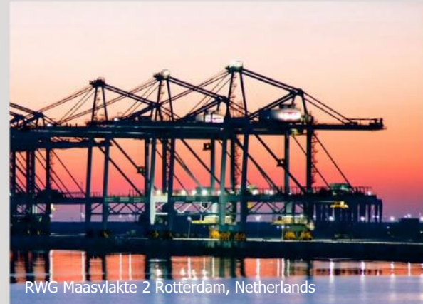
RWG Maasvlakte 2 Rotterdam, Netherlands

Our team consists of highly motivated professionals with the right amount of experience and in-depth knowledge in their respective field of expertise. We run the extra mile and never cut corners. We focus on results while never losing an eye on the human dimension. Being the best is more important than being the biggest. Work should be fun with lots of room for humor. Continuous personal and professional development go hand in hand. The team goes before the individual. We help each other. We set our goals high, but reachable. We never compromise on quality. We deliver what we promise. We are honest.