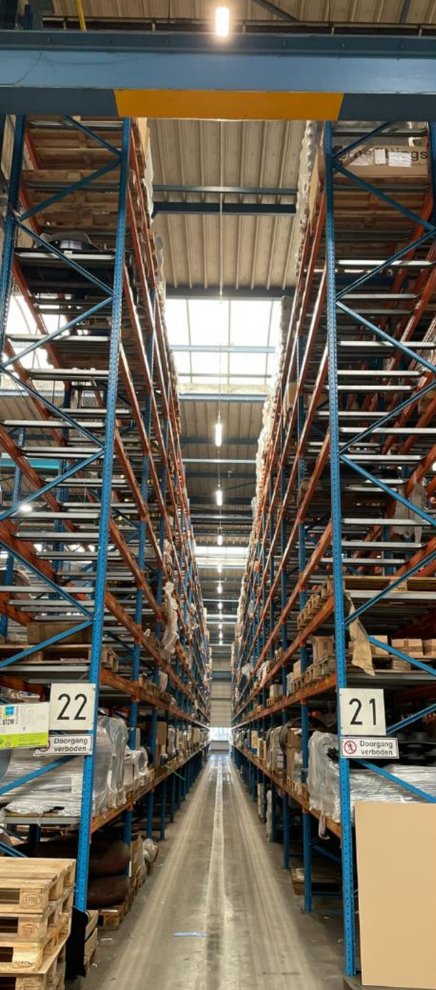
Van Leeuwen Buizen Groep, Netherlands