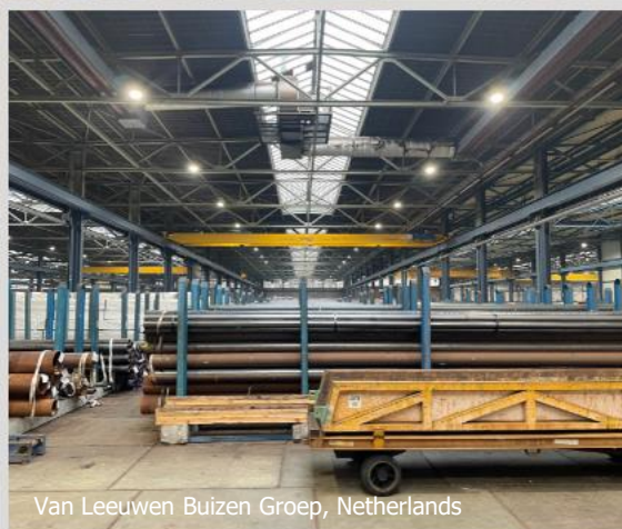
Van Leeuwen Buizen Groep, Netherlands