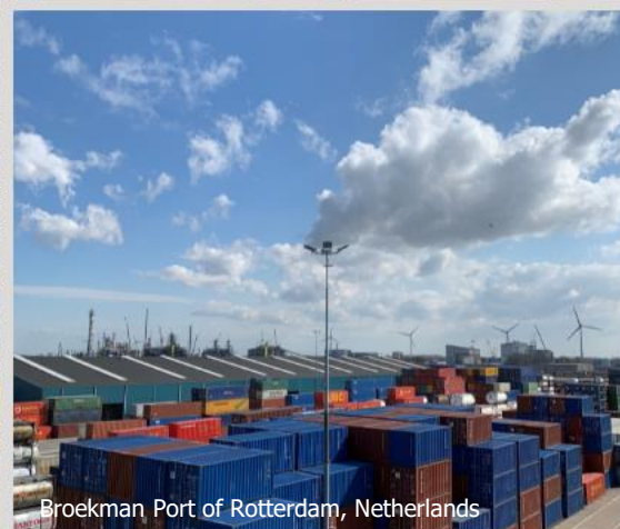
Broekman Port of Rotterdam, Netherlands