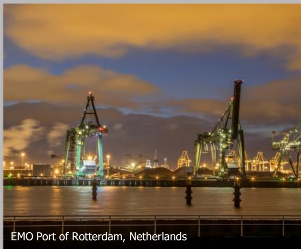
EMO Port of Rotterdam, Netherlands

Lighting fixtures for harbor cranes need to be extremely robust. They require similar specifications as for (port) yard lighting, but additionally they need to withstand (heavy) vibrations. Especially under the trolley, these fixtures have to endure heavy shocks and vibrations at different frequencies. We know about harbor cranes and we are proud to have been selected by Nanhua, world leader in harbor crane lighting, as their official European agent. Beside harbor cranes, there are a wide array of cranes, like construction cranes or indoor portal cranes, for which we offer suitable solutions.