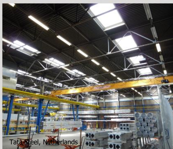
Tata Steel, Netherlands