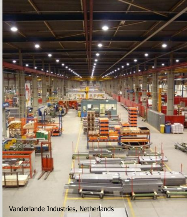
Vanderlande Industries, Netherlands