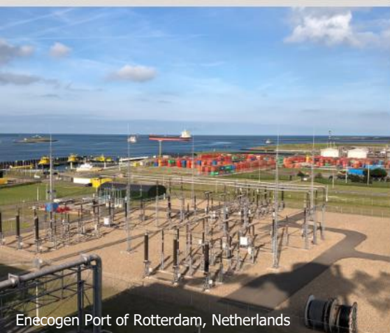
Enecogen Port of Rotterdam, Netherlands