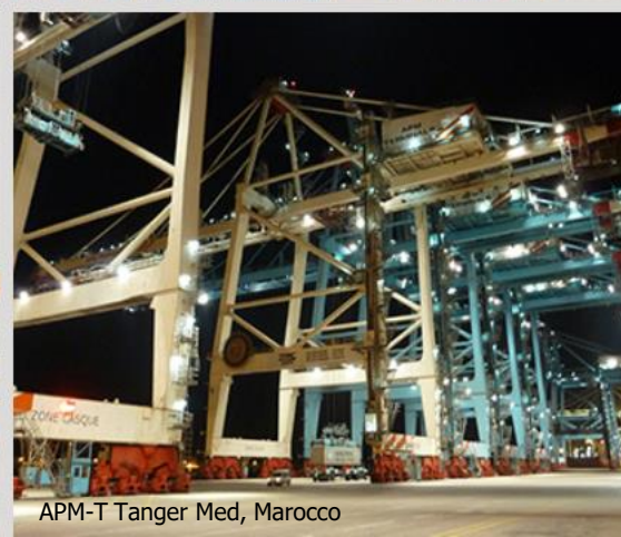
APM-T Tanger Med, Morocco